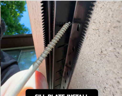
SILL PLATE INSTALL

The quickest and easiest way to fasten RODENT-SHIELD™ is by using the included fasteners and screwing straight up in to the sub-siding.