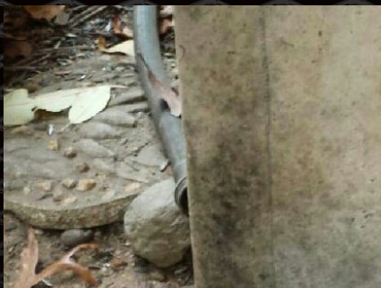
CRITTER FUR, TRACKS, OR "SMUDGES"